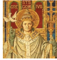
St. Gregory the Great, Pope and Doctor of the Church.

Our Lady of the Assumption, Pray for us!